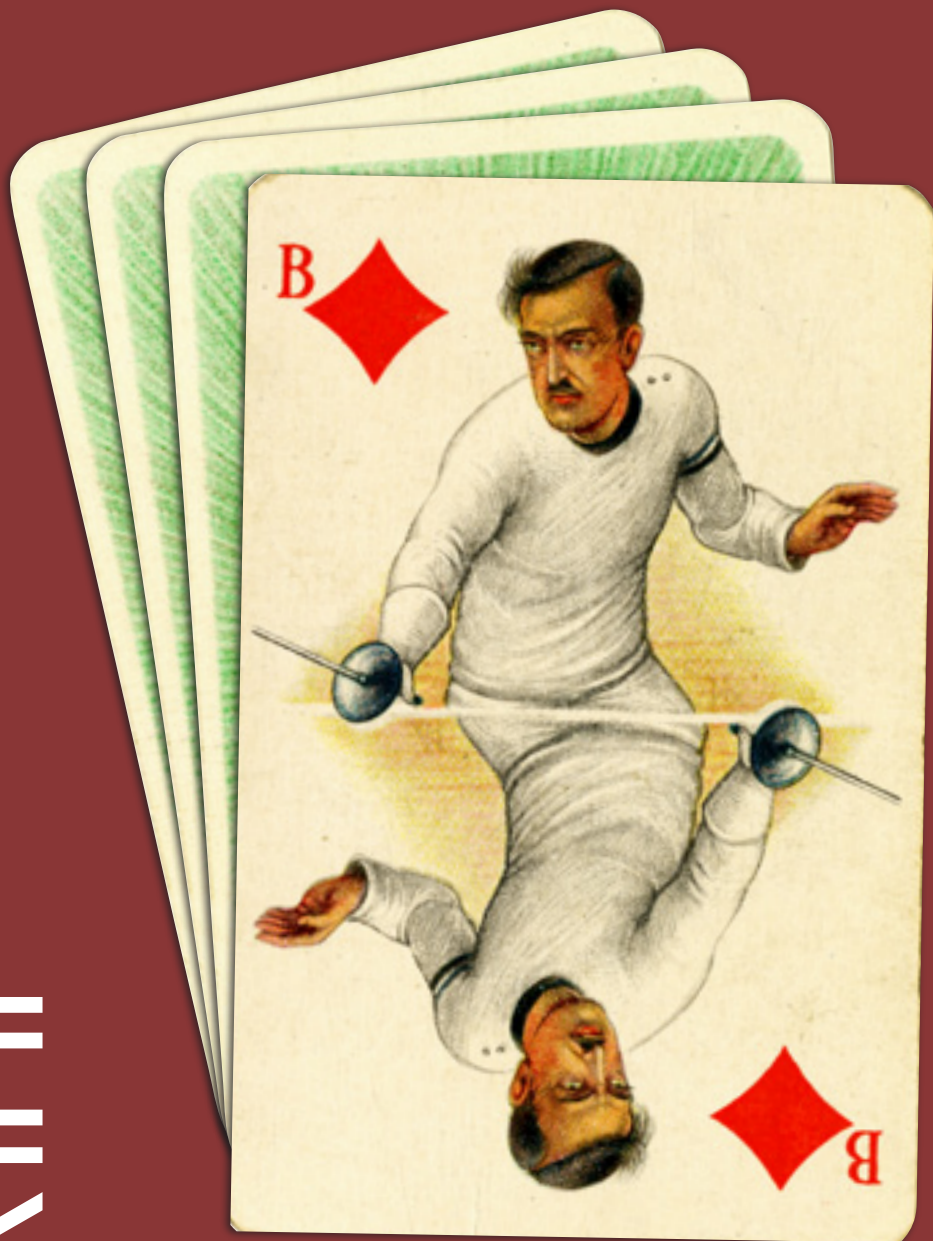
Image: One of a pack of German playing cards produced for the 1928 Olympics in Amsterdam. These are included in the exhibition Sporting Aces: Playing Cards and the Olympic Games at LMA until 13th September.