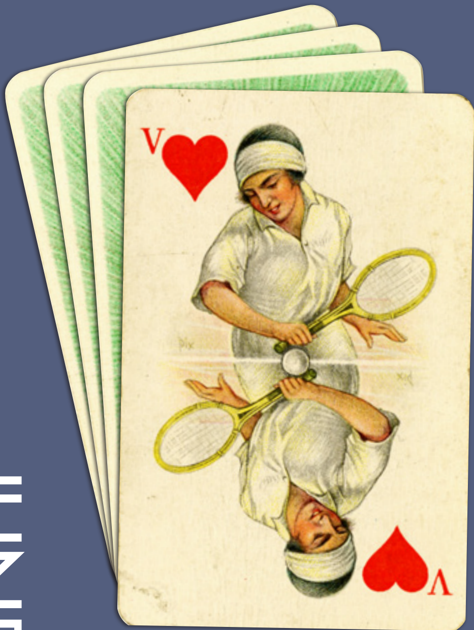
Image: One of a pack of German playing cards produced for the 1928 Olympics in Amsterdam. These are included in the exhibition Sporting Aces: Playing Cards and the Olympic Games at LMA until 13th September.