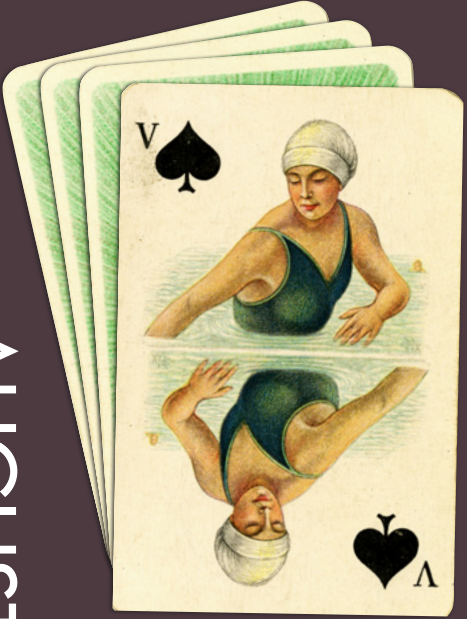
Image: One of a pack of German playing cards produced for the 1928 Olympics in Amsterdam. These are included in the exhibition Sporting Aces: Playing Cards and the Olympic Games at LMA until 13th September.