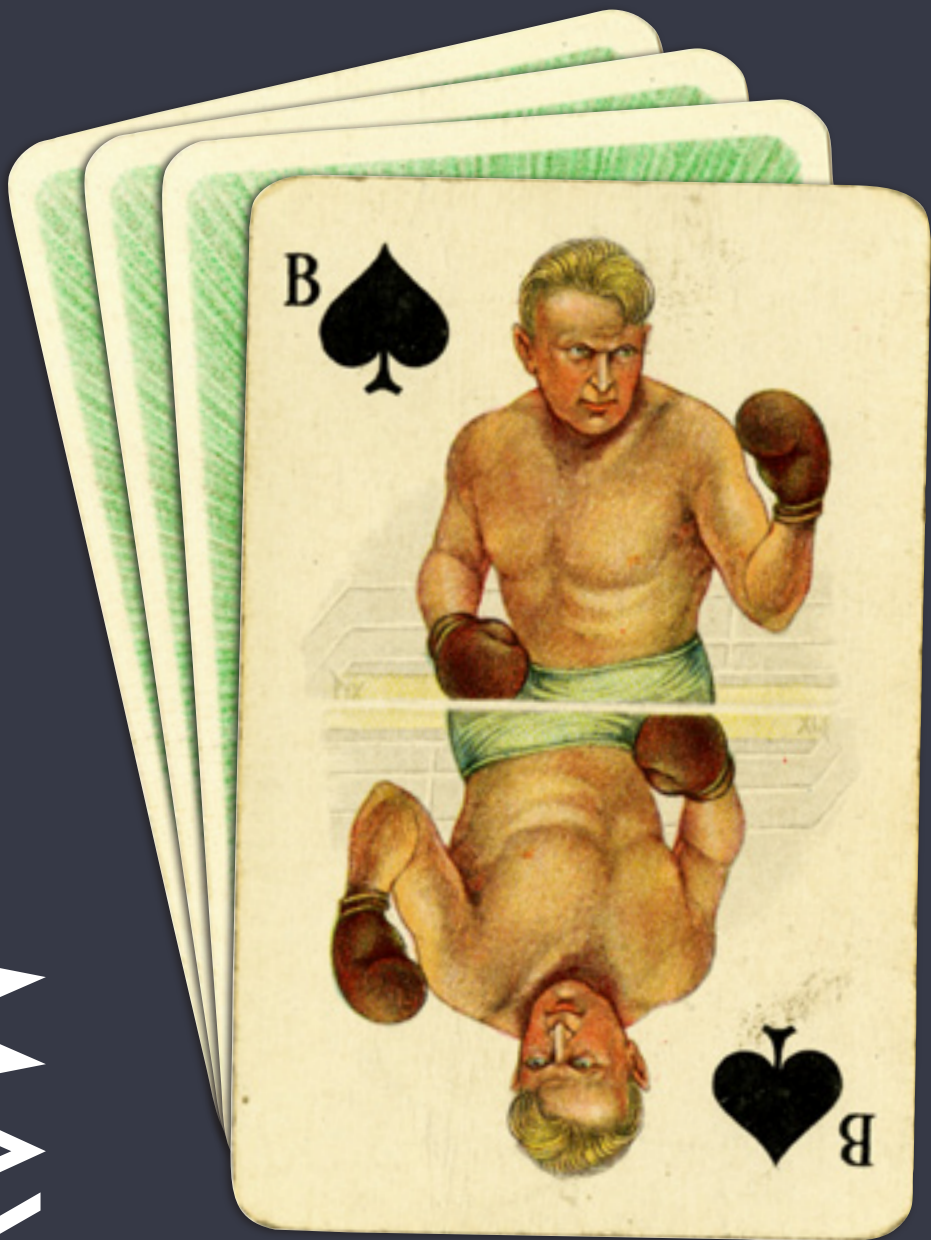
Image: One of a pack of German playing cards produced for the 1928 Olympics in Amsterdam. These are included in the exhibition Sporting Aces: Playing Cards and the Olympic Games at LMA until 13th September.