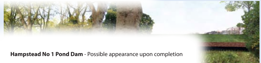
Hampstead No 1 Pond Dam - Possible appearance upon completion