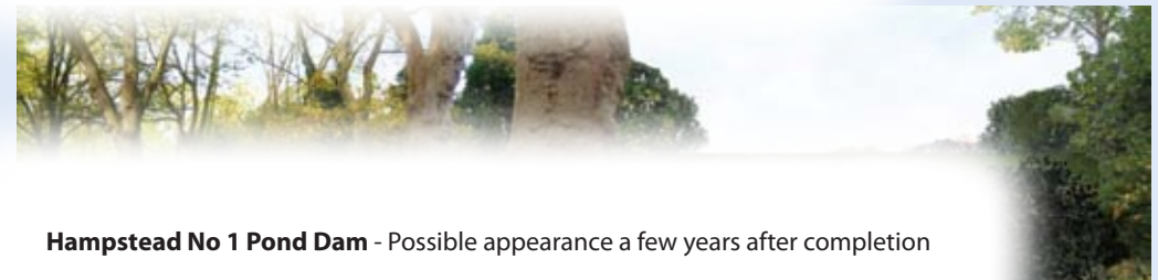
Hampstead No 1 Pond Dam - Possible appearance a few years after completion

Email: hampstead.heath@cityoflondon.gov.uk