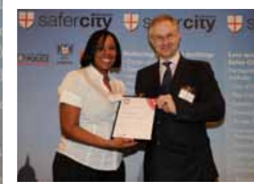
Above: Highly Commended winners being presented with their certificates by the Chairman of the Police Committee; Hennessey's, The Hoop and Grapes, Windsor Fenchurch and The Kings Arms.